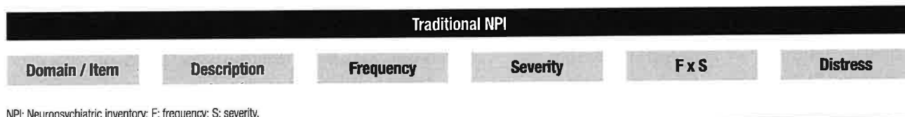
Figure 1. Structure of traditional Neuropsychiatric Inventory.

Neuropsychiatric Inventory – Clinician Rating Scale (NPI-C) – With the participation of J.L. Cummings, responsible for creating the traditional NPI, de Medeiros et al. 23 developed a new version of this scale called the Neuropsychiatric Inventory – Clinician Rating Scale (NPI-C) . Thus, the NPI was restructured in a new version (the